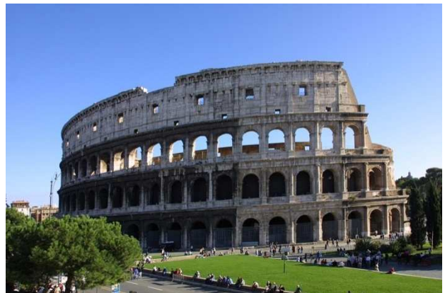
A view of the Coliseum – Rome